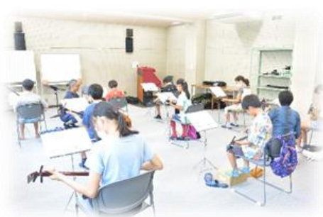
Let's play Okinawa Sanshin