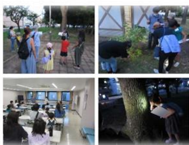
Observation of cicadas hatching