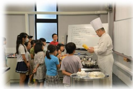
Tokugawa ice cream making