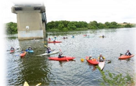
Exploration in a canoe