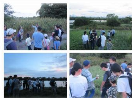
Observation of crickets and bats

❀ Youth Hall information is also available in Chinese and Japanese on our website ❀