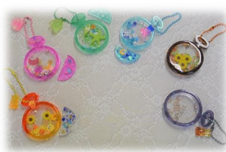
Colorful resin craft