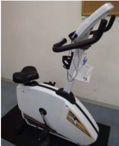
Upright exercise bike