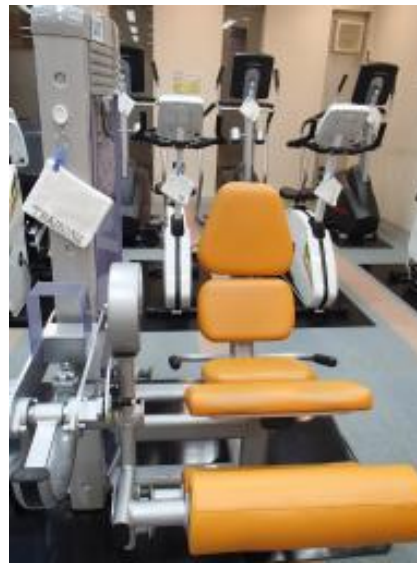
Leg extension and leg curl