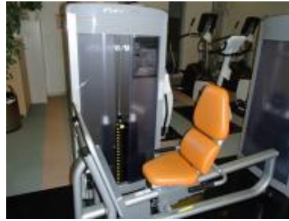
Leg press and calf raise