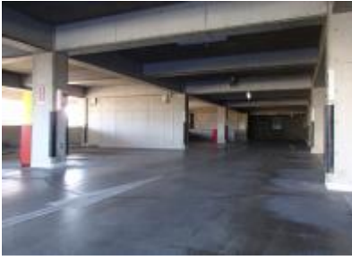
Carpark no. 1