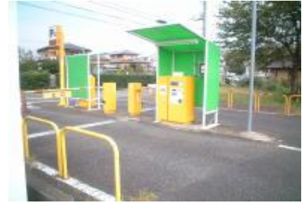
Carpark no. 4