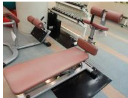
Abdominal muscle stand