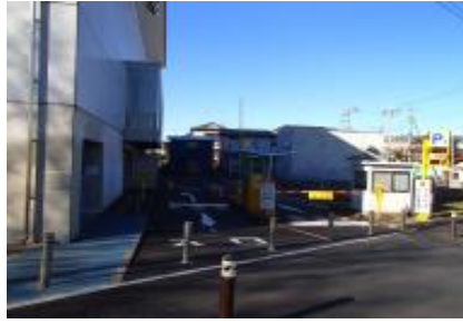
Carpark no. 1 entrance