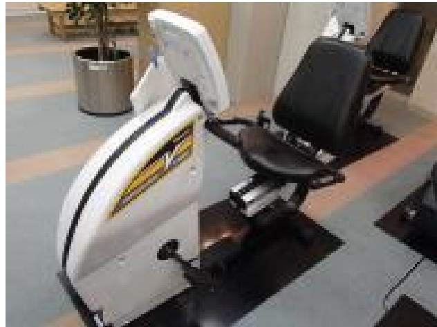
Recumbent exercise bike